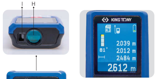
• Color LCD