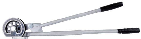
7CA11-15M / 7CA11-16M 7CA11-20S / 7CA11-24S