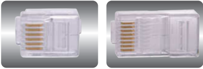
• 6P • 8P